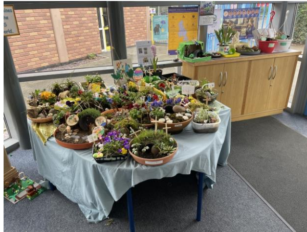
3 - Our Easter Gardens .

The children have used sustainable materials to represent the crucifixion and Resurrection in the form of an Easter garden. They are wonderful and displayed in the school entrance. We have had so many positive comments about them and I hope that you enjoyed supporting your child to make them. Each child received a special treat and two children were chosen as the winners of the competition and received an Easter egg and a book.